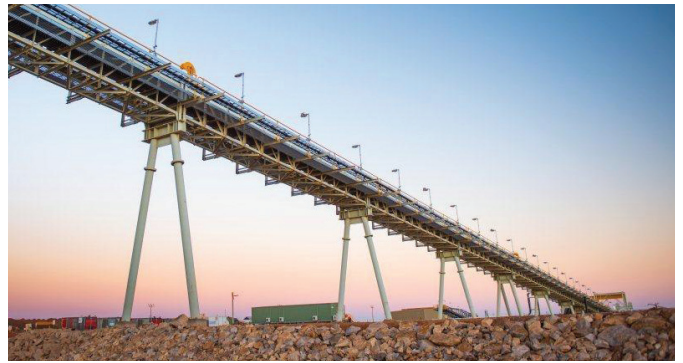
Atlas Iron Ore Stockyard Conveyor System Pilbara Region, WA